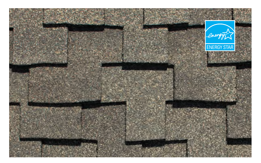
Max Def Weathered Wood

Presidential Solaris Gold's cool roofing granule technology puts color where white used to be while still reflecting intense solar heat.