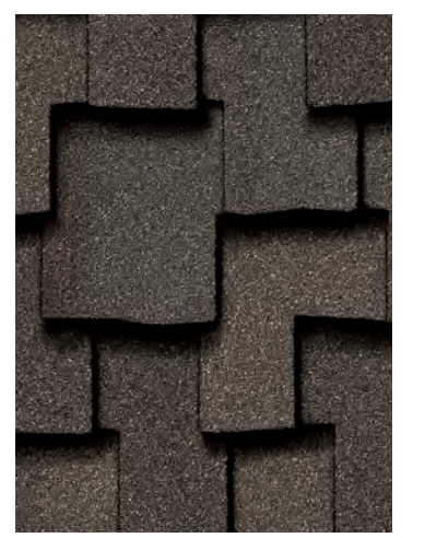
Classic Weathered Wood