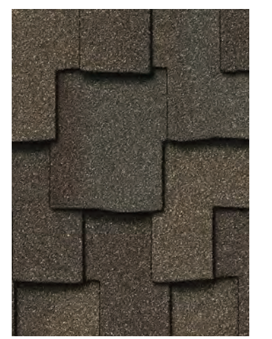
Classic Weathered Wood