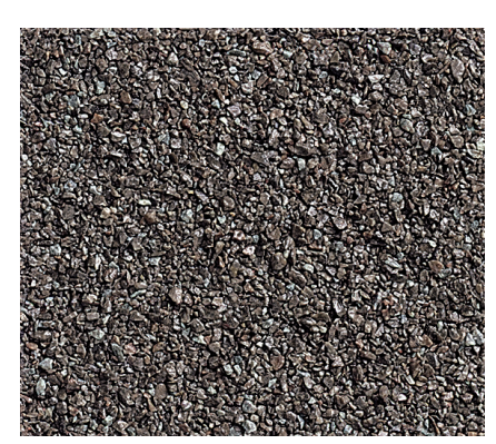
DECRA SHAKE Granite Grey