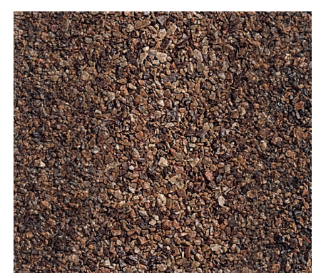
DECRA SHAKE Chestnut