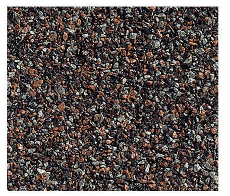
DECRA SHAKE Weathered Timber