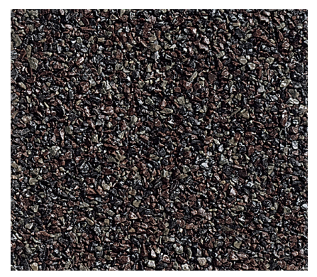
DECRA SHAKE Shadowood