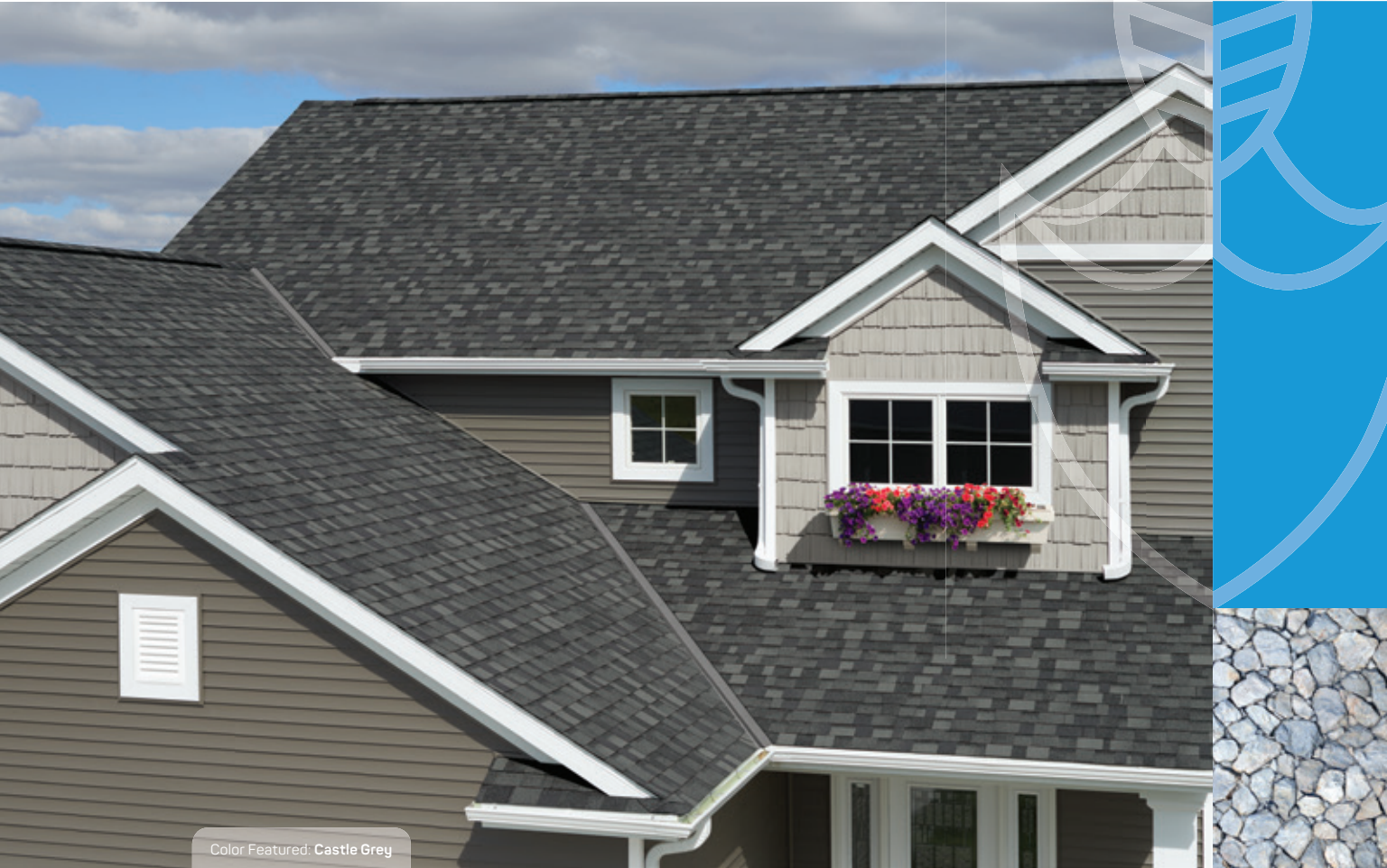
Color Featured: Castle Grey