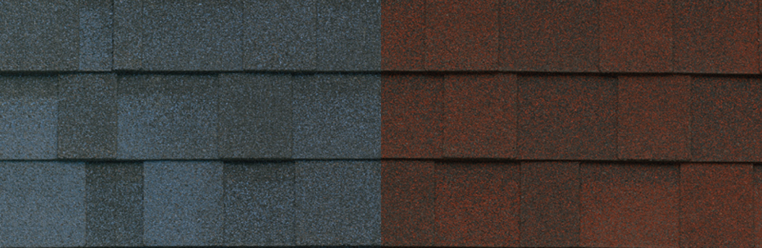
ATLANTIC BLUE 5

MONACO RED Bold, dramatic, eye-catching. PERFECT PAIRINGS: White, grey or beige stone, siding or brick; white, grey, beige or black grey trim.