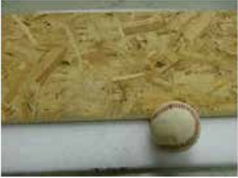
Post-test front (left) and rear (right) photos of LP panel impacted by a baseball in test NASA LVG731