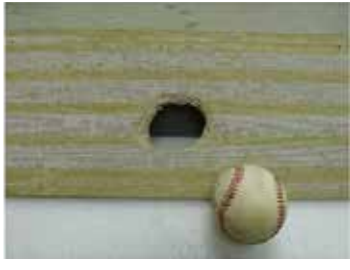
Post-test front (left) and rear (right) photos of fiber cement panel impacted by a baseball in test NASA-LVG733