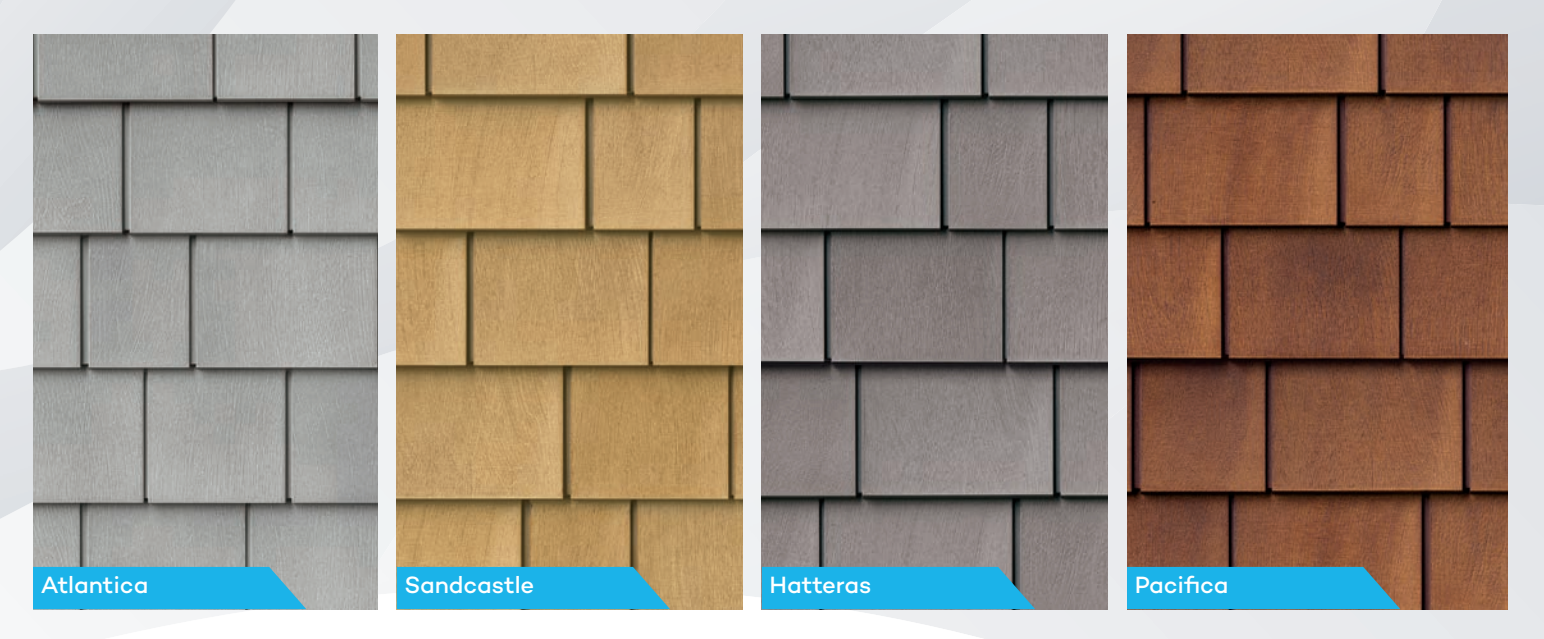
Colors are shown as accurately as the printing process allows.

Corners per box: 5 Linear ft. per box: 6.25