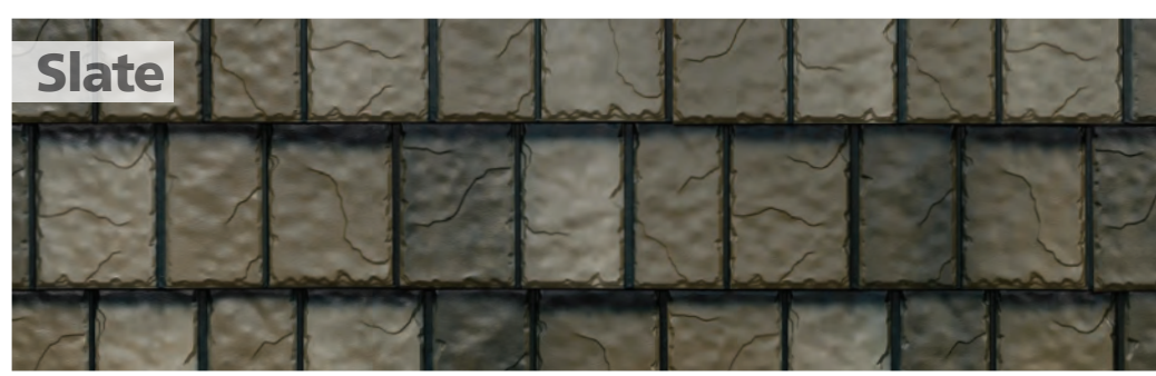
EDCO slate panels provide the natural look of slate with the unmatched performance of steel. Available in solid and enhanced colors.

Manufactured with a unique imaging process, our shake panels provide a natural wood look to enhance the beauty of your home. Available in solid, blended and HD colors.